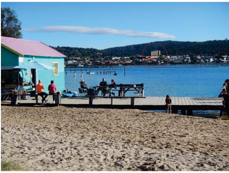
03. Mitchies jetty