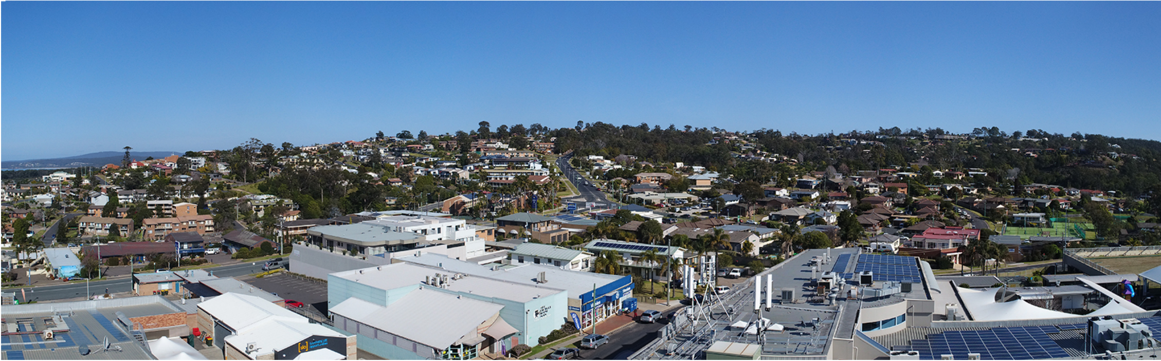
Figure 5: This is the 90 degree image at rooftop level looking south-west. This depicts much of the closer residential which is still only mid-ground.