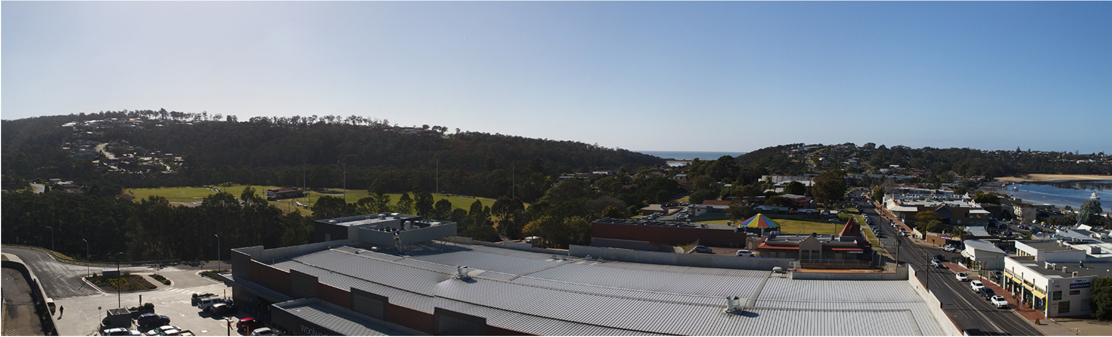
Figure 3: This is the 90 degree image looking east at rooftop level. Similar comment to Figure 2.