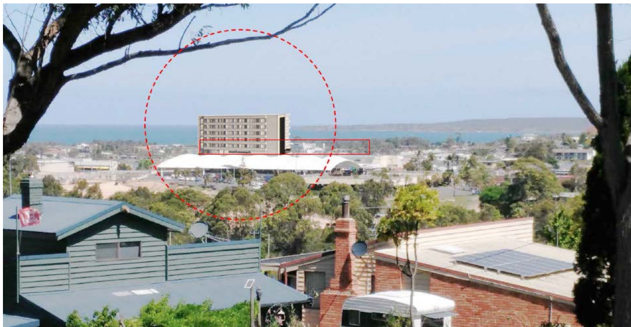
Figure 1 In this image, the hotel tower is prominent and obscures perhaps 30% of a moderate water view. But the red outline is of a bulky building to the current 16 metre height and it is probably more a decision of taste which has more impact.

The recent reviews of height controls in Merimbula have now set a pattern where the skyline from various vantage points will eventually have buildings of greater bulk. In this new context and vision for marimbula the hotel tower is taller but more slender and of specific interest.