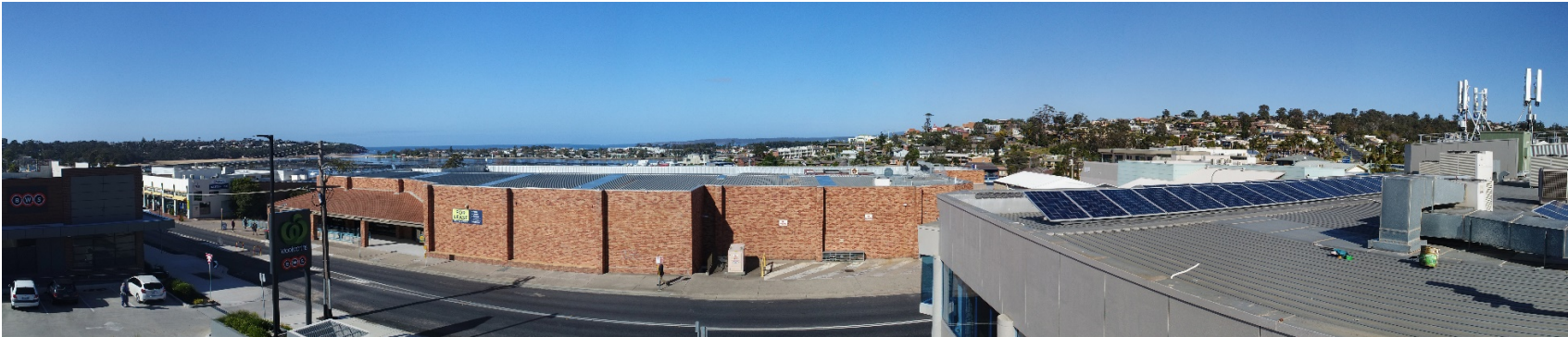
Figure 6 wide angle zoom east to west centred south

Notes: this would be the lowest level with hotel rooms. You will note the views are somewhat commercial / industrial for 4 star