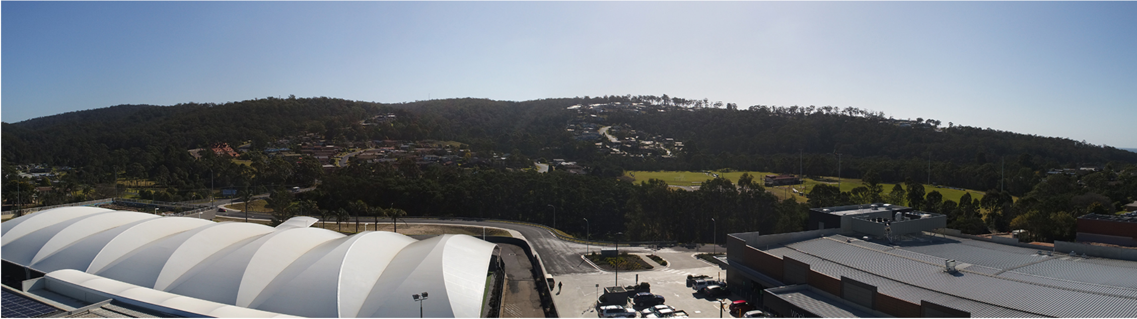
Figure 2: This is the 90 degree image from the rooftop level looking north. It gives an appreciation of the hotel views but also allows some appreciation of the development that would have some view of the hotel. Note how almost all development in the fore and middle ground is not residential.