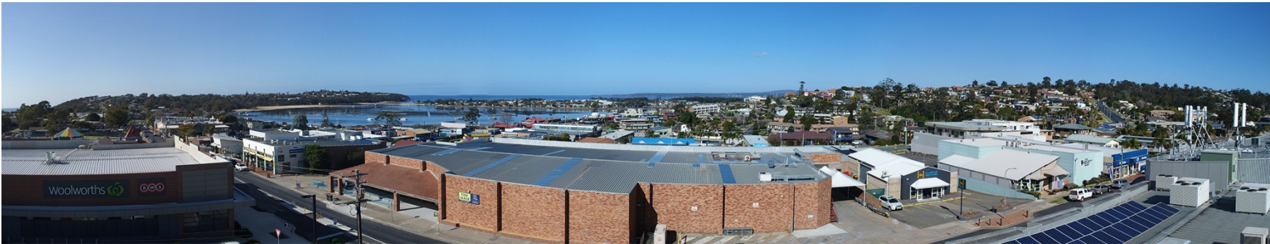
Figure 8 same direction as figure 6 but 2 storeys higher. The view is now more what would be expected in 4 plus star.

At this level the views become probably what would be readily acceptable for 4 plus star