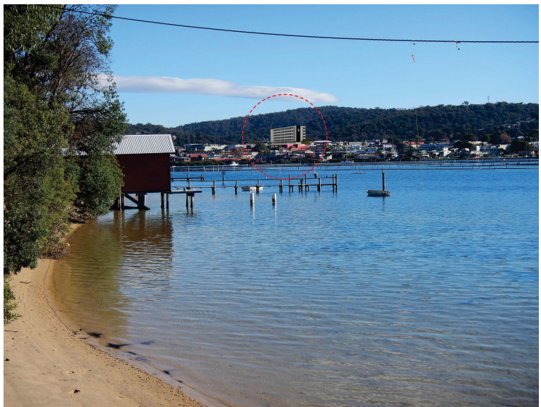
02. Fishpen boatshed