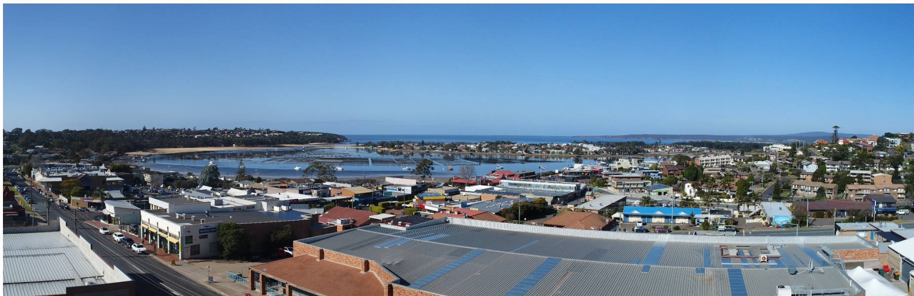
Figure 13 South east view from 6th level hotel rooms