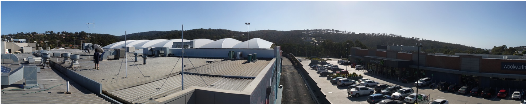
Figure 7 wide angle zoom west to east centred north