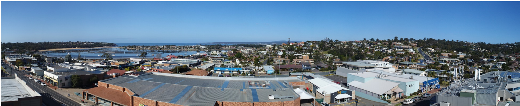
Figure 10 Same direction as figures 6 and 8 but at 6 th floor

Notes: this would be the top floor rooms. Views are excellent.