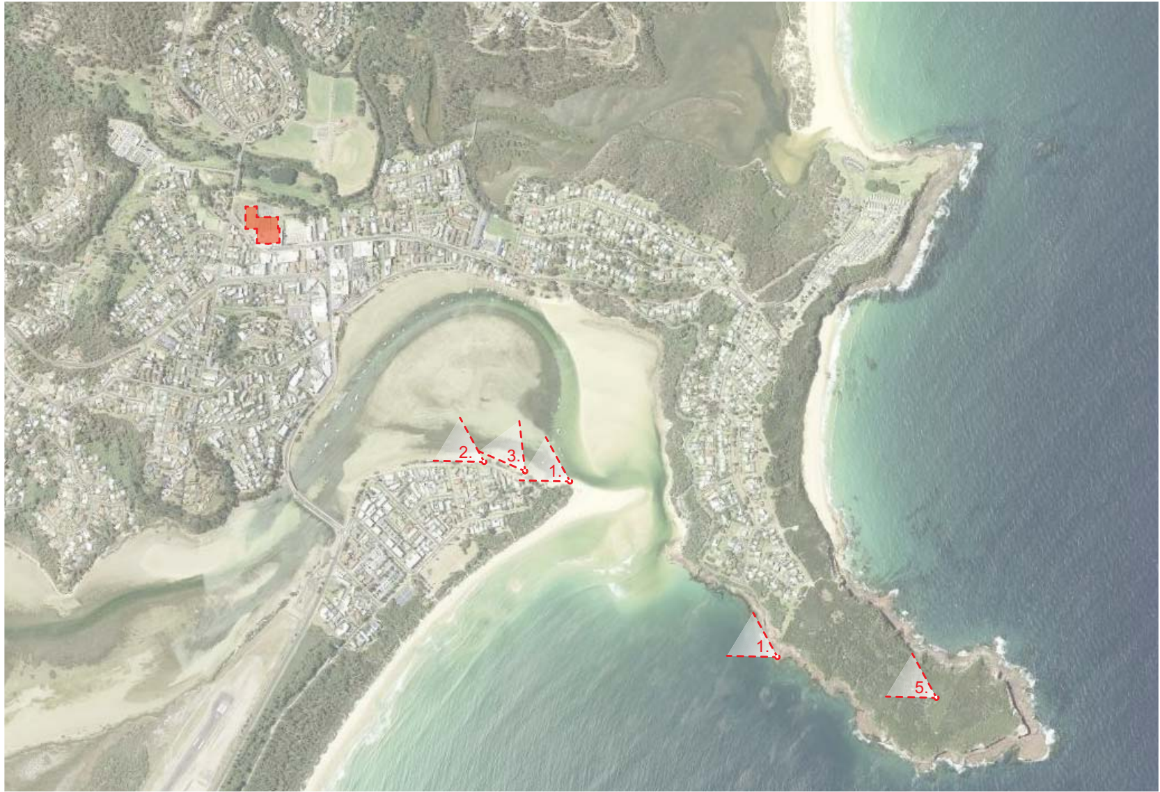
01 DISTANT VIEW LOCATIONS scale 1:NTS