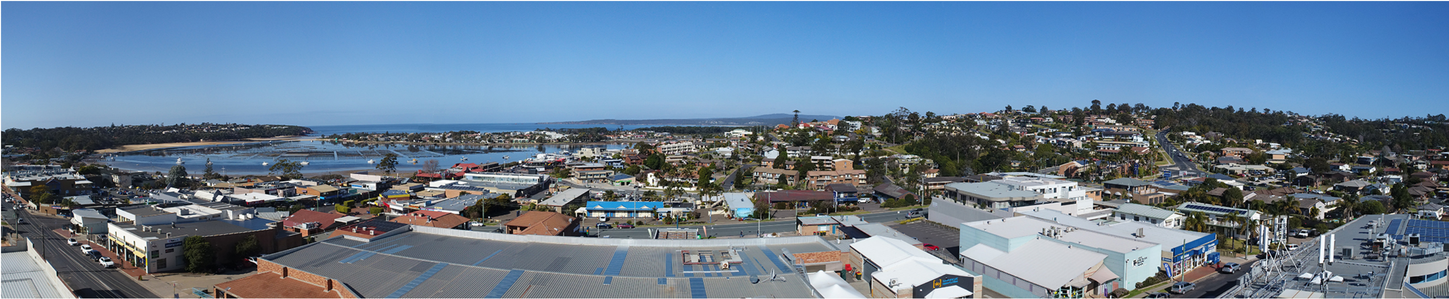
Figure 4: This is the 90 degree image looking south-east from rooftop level. Some close tourist accommodation but again, little residential development in the fore or middle ground.