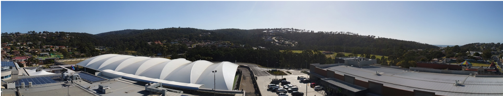
Figure 11 Same direction as figures 7 and 9 but at 6 th floor