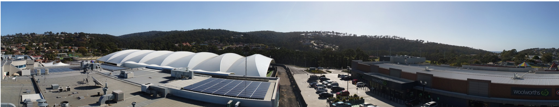
Figure 9 Same direction as Figure 7 but 2 floors up