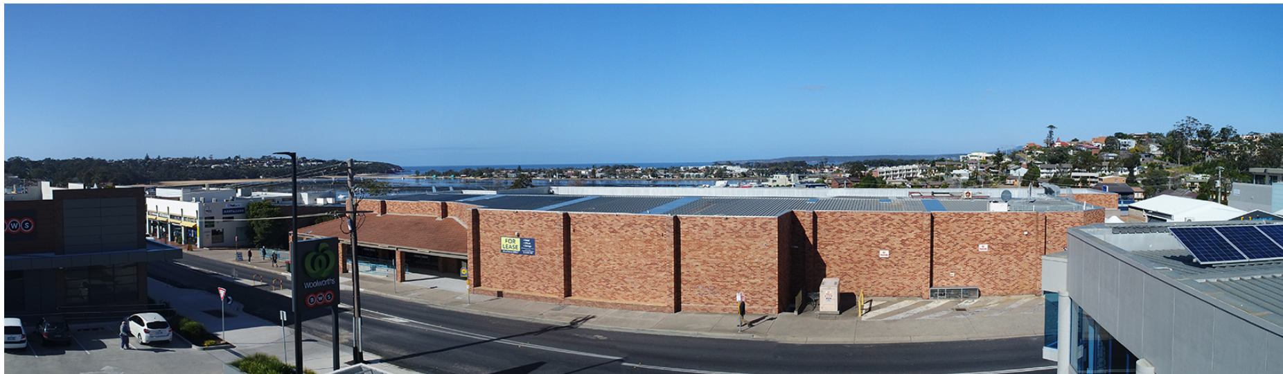
Figure 12 south east view from lowest hotel rooms

The north aspect is not as attractive as the south. Also the most spectacular views are east to south east which will only be captured close to the windows (see figures below). A more square building with rooms on all sides may capture more views but would likely greatly increase cost.