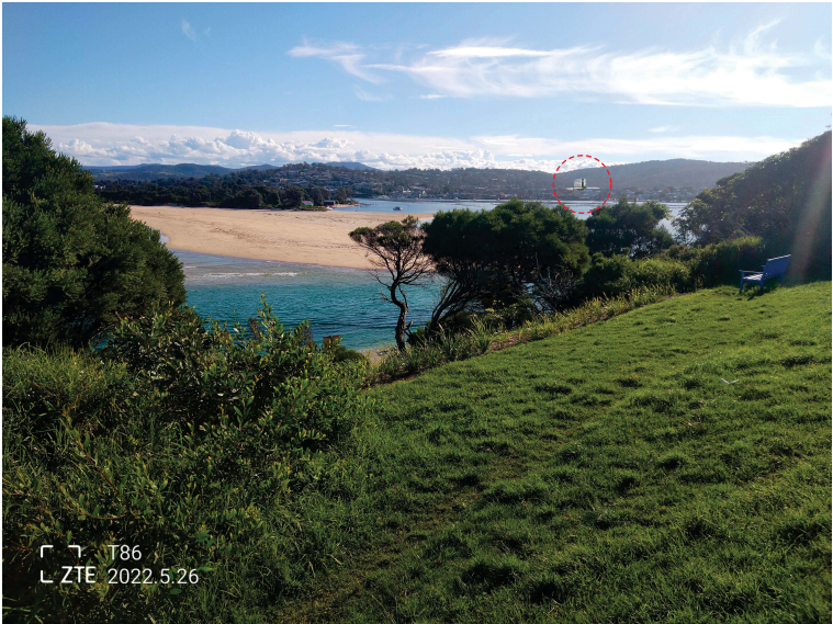
05. Shortpoint walkway